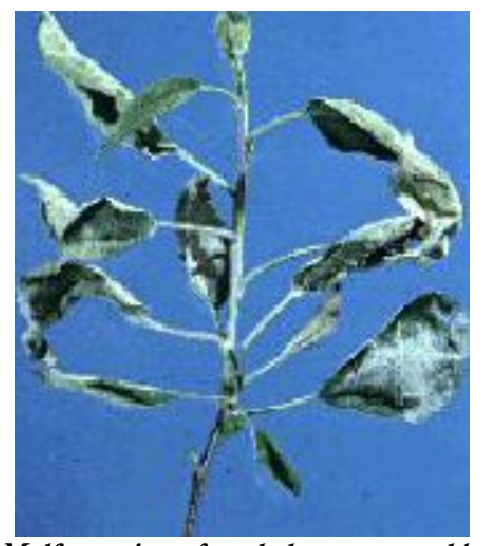
Malformation of apple leaves caused by powdery mildew.